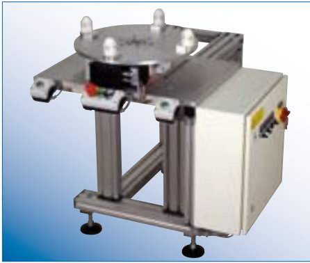
Figure: T4 Rotary Index Table