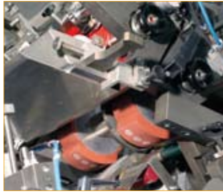
Fig: Close-up view tampon cylinder during transfer process