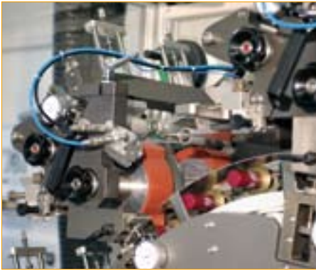
Fig: 1 Rotary tampon printing unit