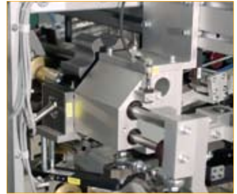
Fig: Infeed station as well as a special jig carrier system with clamping mechanism