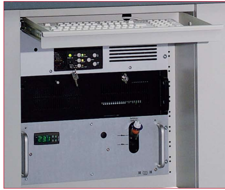
Illustration: Control cabinet